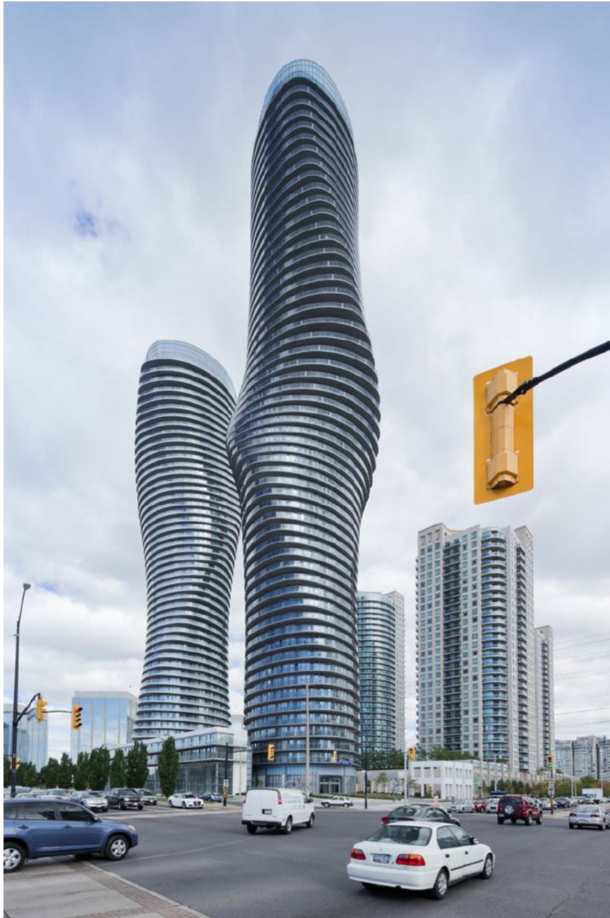
Tower A is 56 stories, while Tower B is 50.

At each floor, the concrete slab cantilevers slightly beyond the building envelope to form a continuous balcony that is slightly deeper at the ends of the floor's longer axis. Between the slabs, a ribbon of floor-to-ceiling glazing encircles each level, forming the weather envelope.