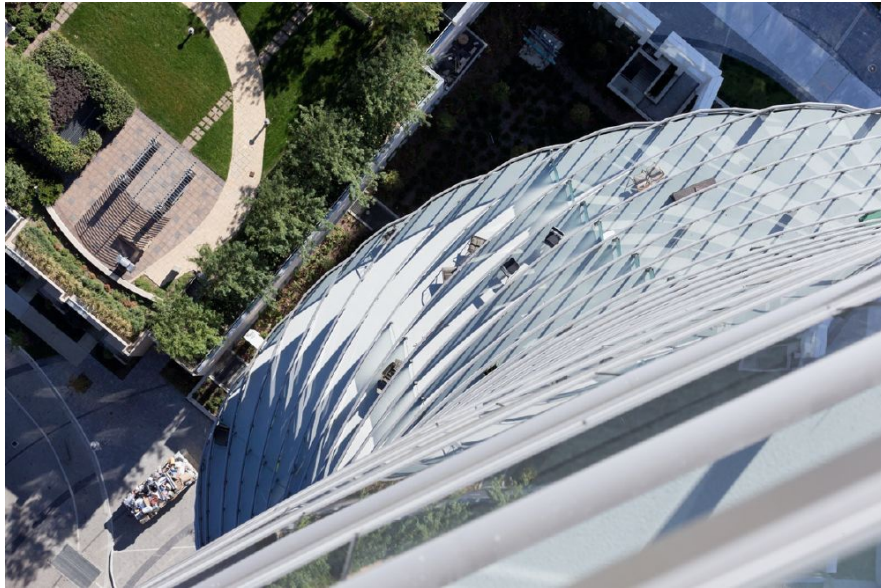
Looking down at the balconies of the Absolute towers.